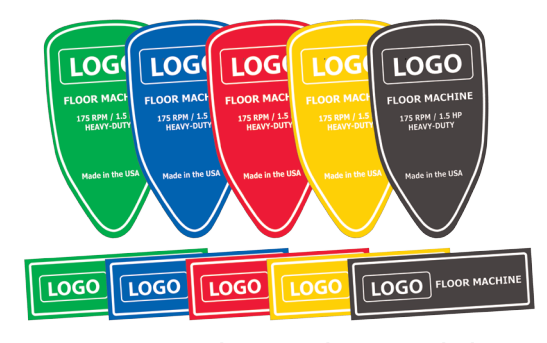
Custom Switch Box and Motor Labels

We work with your marketing staff to develop labels and product sell sheets that are consistent with the look of your current marketing materials. Our marketing director works with you to gather color preferences, logo and contact information. Our in-house graphic design team provides you with proofs of what your equipment and materials will look like before ordering! From start to finish, you can have your complete product line in as little as one week! Contact us or visit our website to learn more about how to get started. The Private Label Program requires a minimum order of 12 machines.