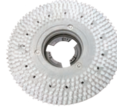
Optional 1505 14" Short Bristle Pad Driver