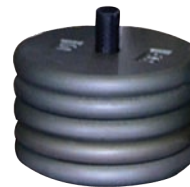
Optional Unicorn Weight Kit: add up to 50 extra pounds of pressure UWK