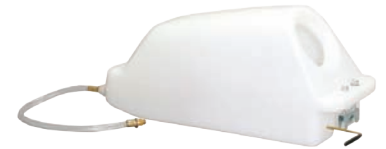
Optional Solution Tank: for efficient wet scrubbing SST-4