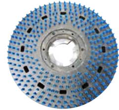
Optional 1705 16" Short Bristle Pad Driver