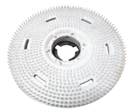
Optional 2105 19" Short Bristle Pad Driver