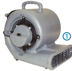
① Aim Flat

Compare us to the competition – discover the difference!