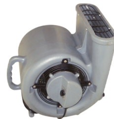
③ Aim at 90°