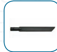
10-0033 17" Crevice Tool