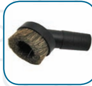
10-0037 3" Round Dust Brush