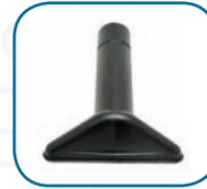
10-0031 5" Upholstery Tool