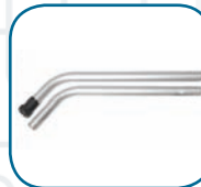
10-0029 Aluminum 2-Piece Wand

ACE BACKPACK VACUUM 10-Quart Capacity, 1.5 HP 2-Stage Motor, 1122 Watts