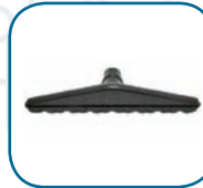
10-0032-C 14" Scalloped Floor Tool